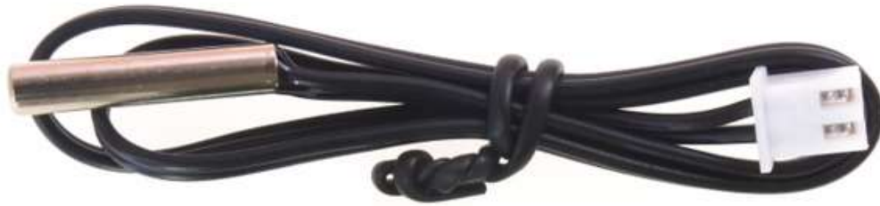
W1209 Temperature Control Switch