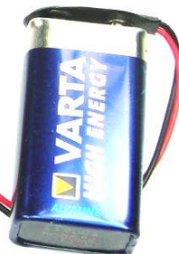
Battery not included