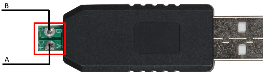
RS485 Schematic image:

Please mind that both cables must be of the same length.