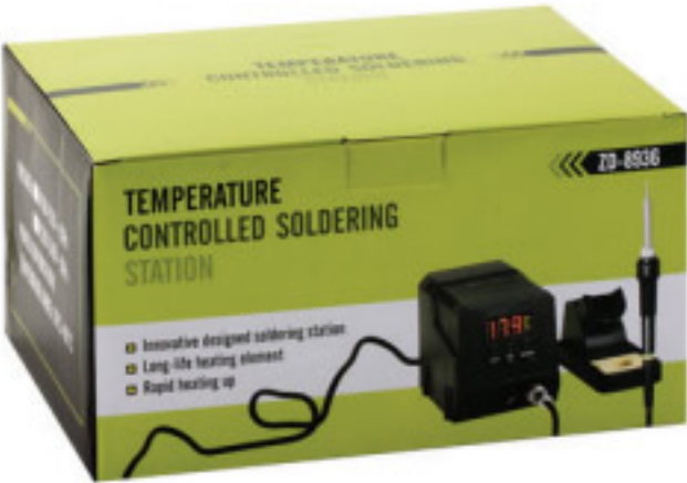
color box package