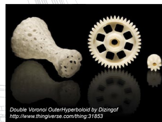
Double Voronoi OuterHyperboloid by Dizingof http://www.thingiverse.com/thing:31853