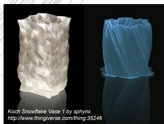
Koch Snowflake Vase 1 by sphynx http://www.thingiverse.com/thing:35246