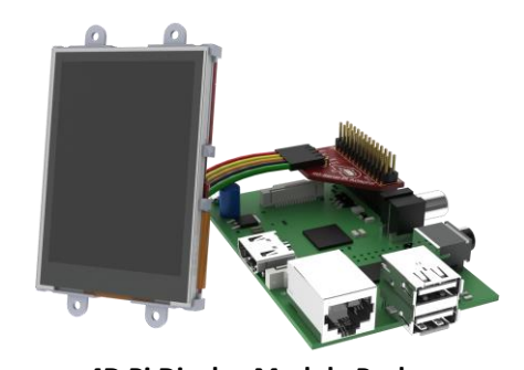
4D Pi Display Module Pack (4D Pi Serial Adaptor is one part of this pack)

NOTE (*): Raspberry Pi remains the property of the Raspberry Pi Foundation. All references to the words 'Raspberry Pi' are Trademarks of the Raspberry Pi Foundation, and all references to 4D Systems modules/adaptors with the Raspberry Pi are based on compatibility with the Raspberry Pi Hardware, and do not indicate ownership of or to the Raspberry Pi in any way.