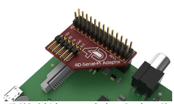
4D Pi Serial Adaptor attached to a Raspberry Pi