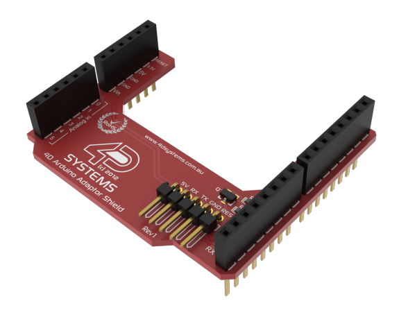
4D Arduino Adaptor Shield

The 4D Arduino Library is available to download from the 4D Systems website, www.4dsystems.com.au