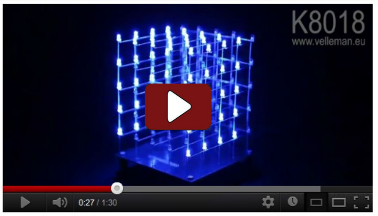
click to play movie

THE SOFTWARE CAN BE DOWNLOADED FROM OUR WEBSITE